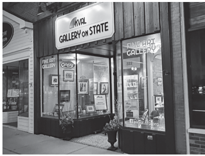
KVAL Gallery on State

The KVAL Gallery on State is located at 322 West State Street in the heart of downtown Sycamore. Exposed brick walls and tin ceilings provide the perfect ambiance to exhibit and sell beautiful art. Our exhibit changes every 3 months and we have a different Featured Artist every month. Along with KVAL special exhibits, we participate in the Sycamore Chamber downtown events throughout the year.